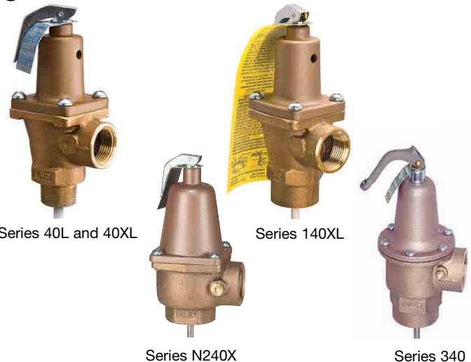
Series 40L and 40XL

ASME Rated, ANSI Z21.22, Design certified and listed by CSA, National Board of B&PVI to Section IV of the ASME B&PV code and meet current FHA requirements and ANSI Z21.22 in addition to Military Spec. MIL-V-136-12D, Type I.